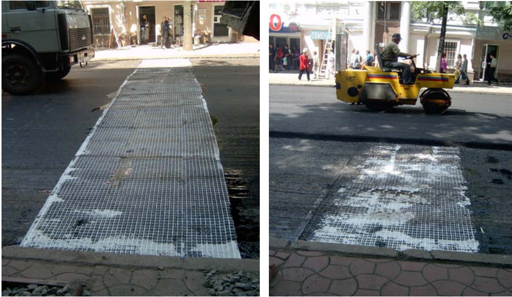
Fig. 7 – Reinforcement of wearing course over the crack repaired with geosynthetic grid “Armatex RS 50/50”

Two year monitoring of wearing course repaired by means of suggested technology has shown that reflected transverse cracks on it in areas of repaired through-the-thickness cracks did not appear as opposed to the site where traditional technology of asphalt wearing course repair by layers buildup was implemented.