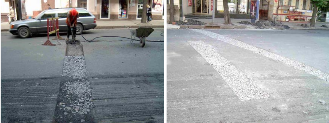
Fig. 5 – Cutting of through-the-thickness thermal cracks and crushed stone layer application

Proposed technology and scheme of through-the-thickness crack cutting allowed laying of crack stopping layer of crushed stone ranging from 5 to 20 mm 8-9 cm thick (Fig. 5) and a layer of coarse-aggregate porous asphalt concrete 6-8 cm thick (Fig. 6) instead of removed old asphalt concrete layers. Prior to laying of surface layer from fine-aggregate asphalt concrete mix (type “B” based on bitumen modified with 3 % of SBS polymer) on total width of the street runway, reinforcement of repaired areas over cracks with geosynthetic grid “Armatex RS 50/50” 1.5 m wide was performed (Fig. 7).