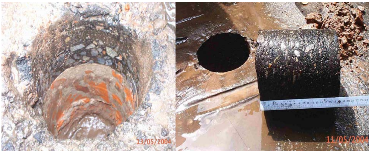
Fig. 2 – General view of the core taken in the pavement area without cracks in wearing course

Coring of the pavement in areas without cracks in wearing course (Fig. 2) and with thermal cracks (Fig. 2) has shown that pavement consists of asphalt concrete layers 20 to 22 cm thick laid on the mineral material layer constituting mixture of broken bricks and ground concrete 25 to 40 cm thick. The material of base course was used during rebuilding period of roads and streets in Kharkiv after World War II.