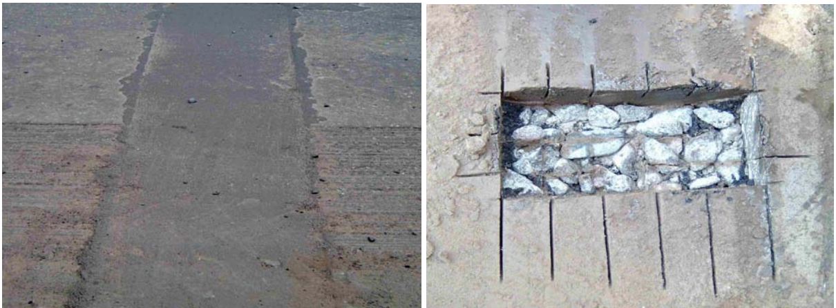
Fig. 6 – General view of site with coarse-aggregate asphalt concrete mix applied on crushed stone layer over the crack