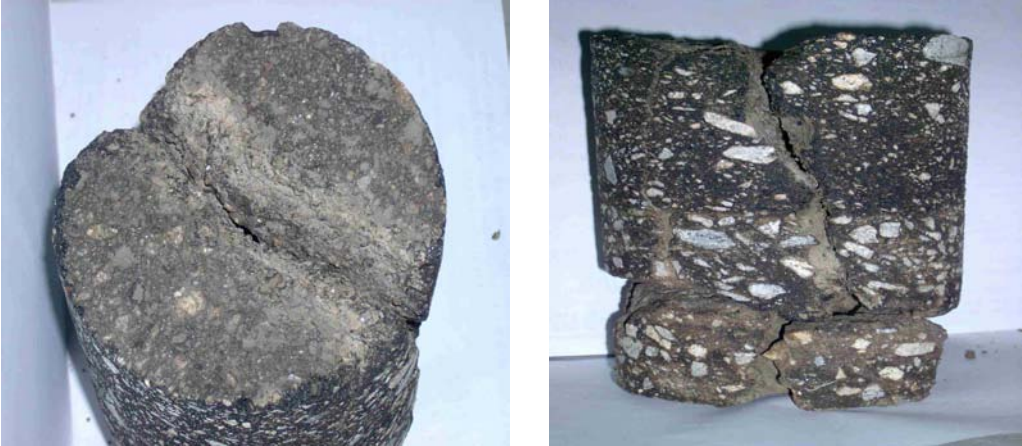
Fig. 3 – General view of the core taken from pavement with crack

bitumen tack coating on old asphalt wearing course surface and laying of new asphalt concrete layer on it, cannot be effective. Experience of highways service shows that usage of such repair technology of road wearing courses with through-the-thickness cracks results in development of reflected cracks in new monolithic asphalt layer already in one or two years. After three years of service reflected cracks open and can be visually observed. Formation of reflected cracks leads to water saturation of base courses and subsequent decrease of bearing capacity of the whole pavement construction.