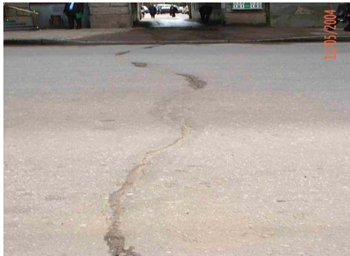
Fig. 1 – General view of prevailing transverse thermal cracks with broken edges in asphalt wearing courses (Sumaskaia str., Kharkiv)

means of asphalt concrete layers buildup. Recently injecting repair technology of wide transverse thermal cracks with broken edges has been applied. It was implemented by means of special machine manufactured by “Savalko” using slurry seal mixture.